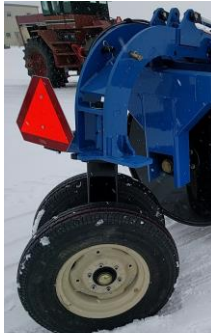
Hydraulic Wing Steer